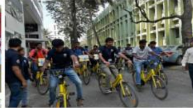
E-WASTE AWARENESS CYCLOTHON