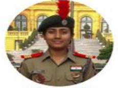
JUO KRITIKA YEP VIETNAM 2018