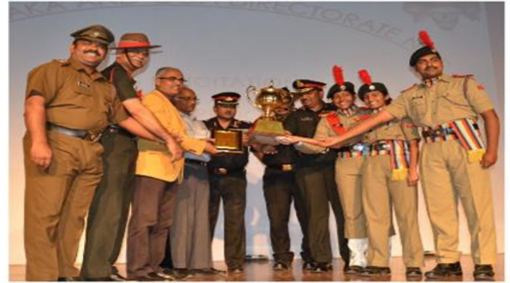
BEST INSTITUTION SW - 2018