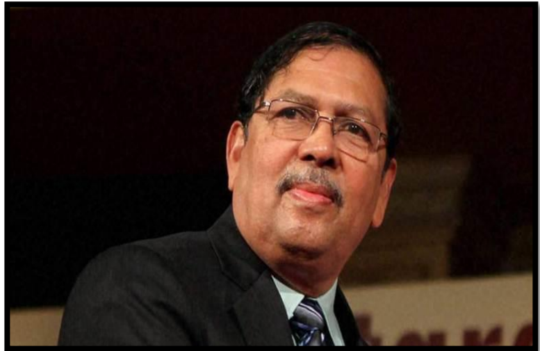
Justice Santhosh N. Hegde “Social Responsibilities of Young Engineers” Dt. 30.7.2019