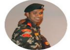
JUO BHARAT DIXIT YEP RUSSIA 2016