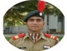
SUO MADHAN YEP RUSSIA 2019