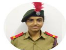
JUO ANANYA AITSC 2019