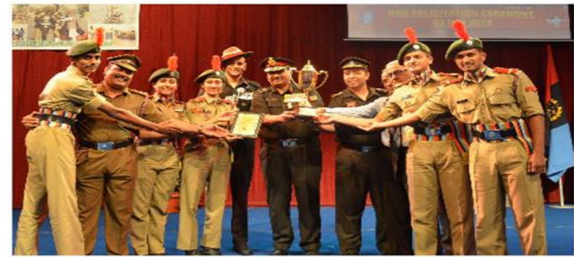
OVERALL BEST INSTITUTION - 2019