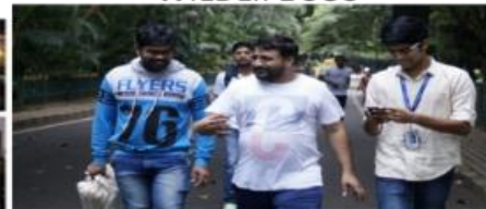
SWACCH BHARATH AWARENESS