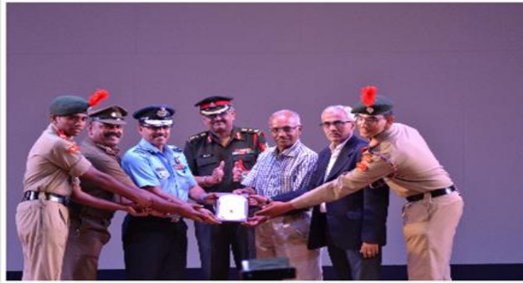
BEST INSTITUTION SD - 2017