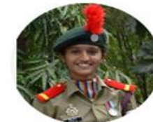
JUO MONIKA AITSC 2017